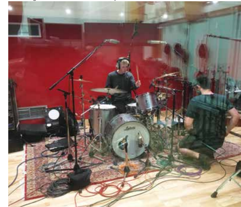
Recording at the World Famous Abbey Road Studios

/// QE has helped me develop as a person. My confidence has improved and I've exceeded my expectations academically. ///